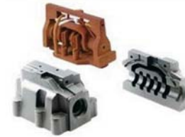
Moulding and Casting Technology