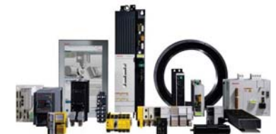
Electric Drives and Controls