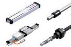
Linear Motion Technology