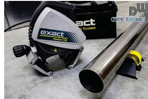
Pipe Beveling Equipment