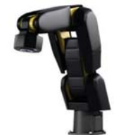
Production Assistants (APAS)