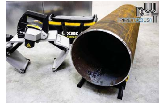
Pipe Cutting & Beveling Machine