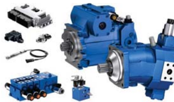
Mobile Hydraulics and Technology